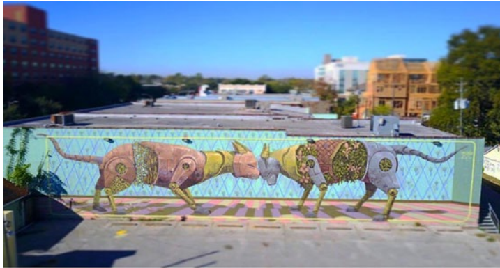
CREATED BY @PIXELPANCHO IN HOUSTON, TEXAS