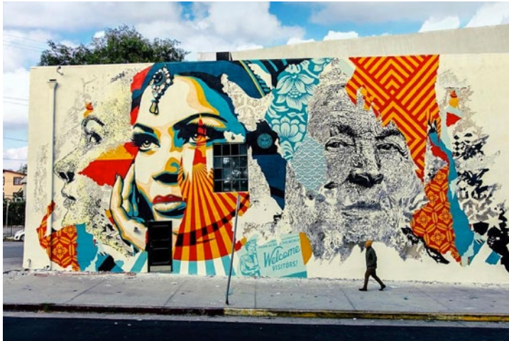
CREATED BY @OBEYGIANT AND @VHILS IN SILVER LAKE, CA.

In 2018 the aim of SUPERFLAT New Bedford is to begin bringing several high quality murals to the city. By convening local, national and international artists, the goal is to highlight art that reflects and resonates with the community in key locations throughout the city. Though we are an all volunteer effort at this stage, we firmly believe artists should get paid for their work, and know that a flourishing arts economy means new jobs and new careers. New Bedford artists are no stranger to the power of public art, and we have seen the success of other organizations like the Chicago Public Art Group and Mural Arts Philadelphia. Closer to home Pow Wow in Worcester and Beyond Walls in Lynn are having transformative effects on the visual and cultural landscape of those cities. There are many more examples, and in 2019 we expect to expand our efforts.